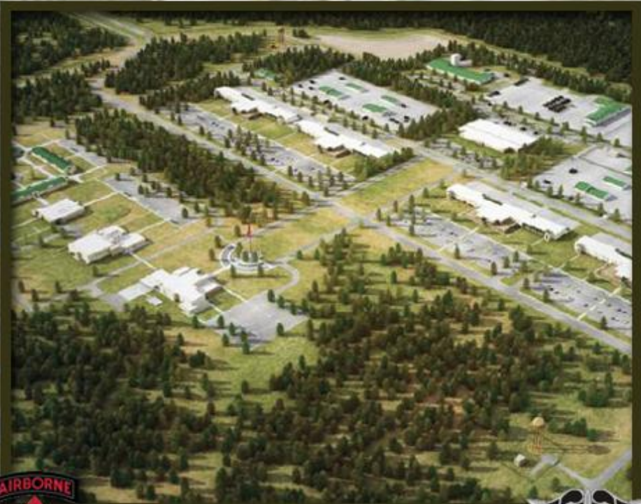
7TH SPECIAL FORCES GROUP (AIRBORNE)