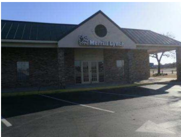
Choctaw Plaza - 133 Racetrack Rd

133 Racetrack Road NW, Fort Walton Beach, FL 32547 5,000 sq ft of office space with furniture