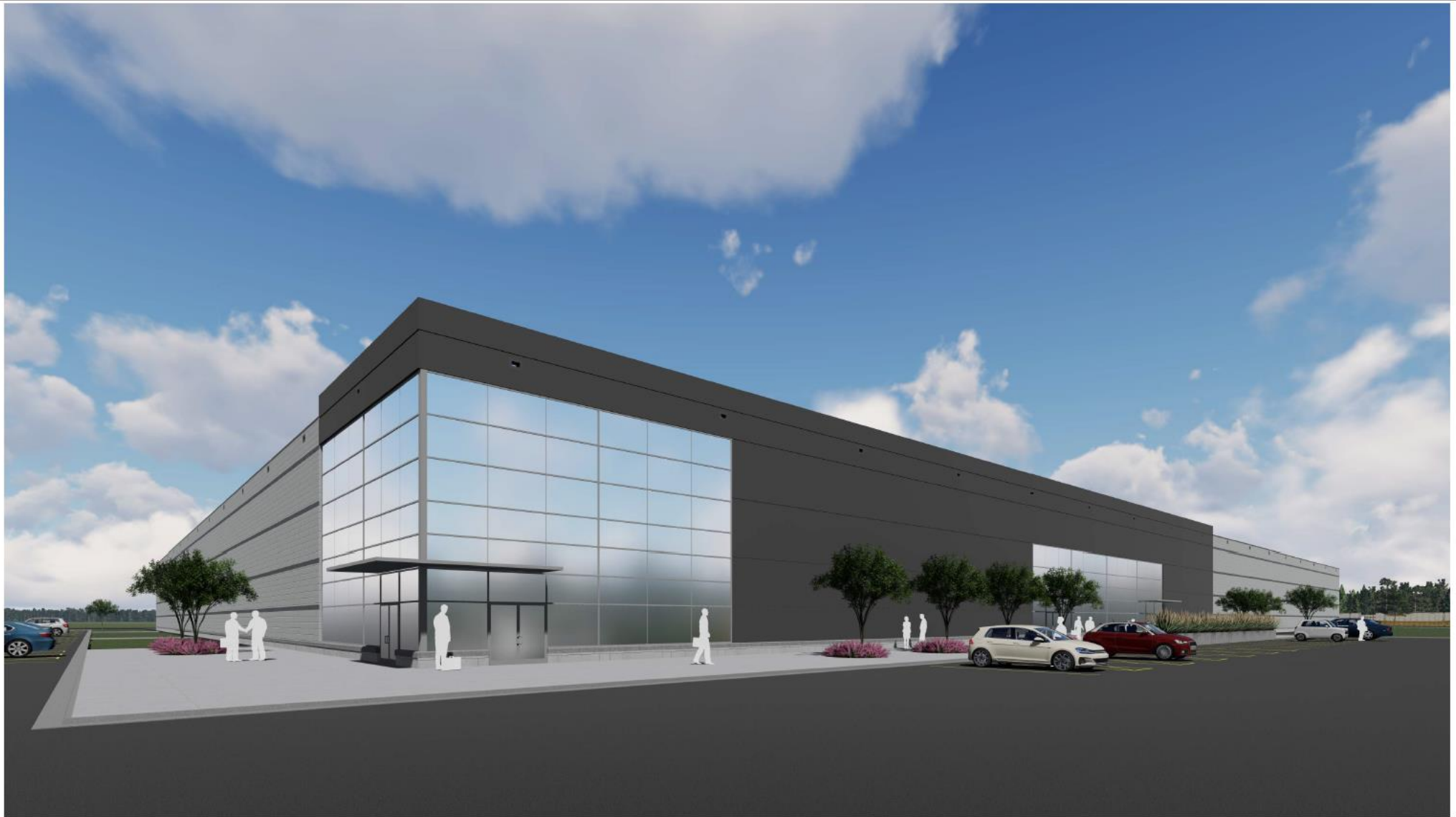
CONCEPTUAL BUILDING FRONT PERSPECTIVE