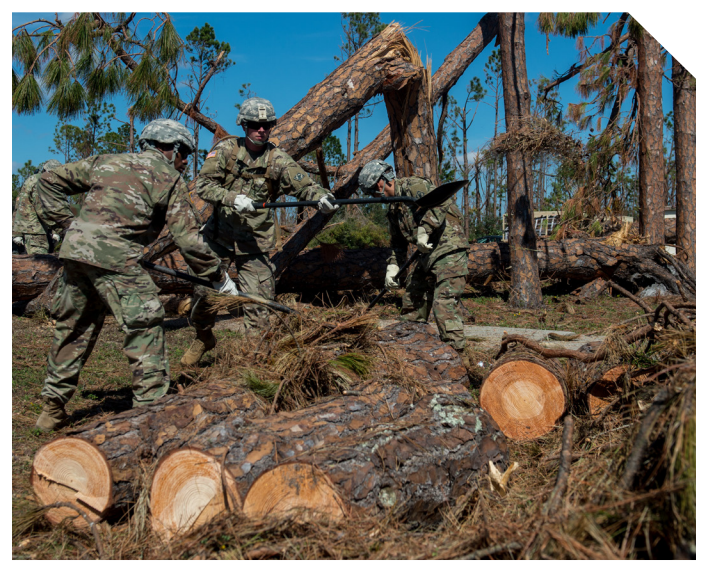
U.S. Army soldiers from the 46th Engineer Battalion moved tree debris into piles on Tyndall Air Force Base, Florida. After Hurricane Michael swept the area in 2018, multiple major commands mobilized relief assets in an effort to restore operations after the hurricane caused catastrophic damage to the base and surrounding communities (U.S. Air Force photo by Senior Airman Sean Carnes).

Florida Sentinel Landscape hopes to establish a formal landowner recognition program to acknowledge the significant contributions of local landowners to the Northwest Florida Sentinel Landscape goals and objectives.